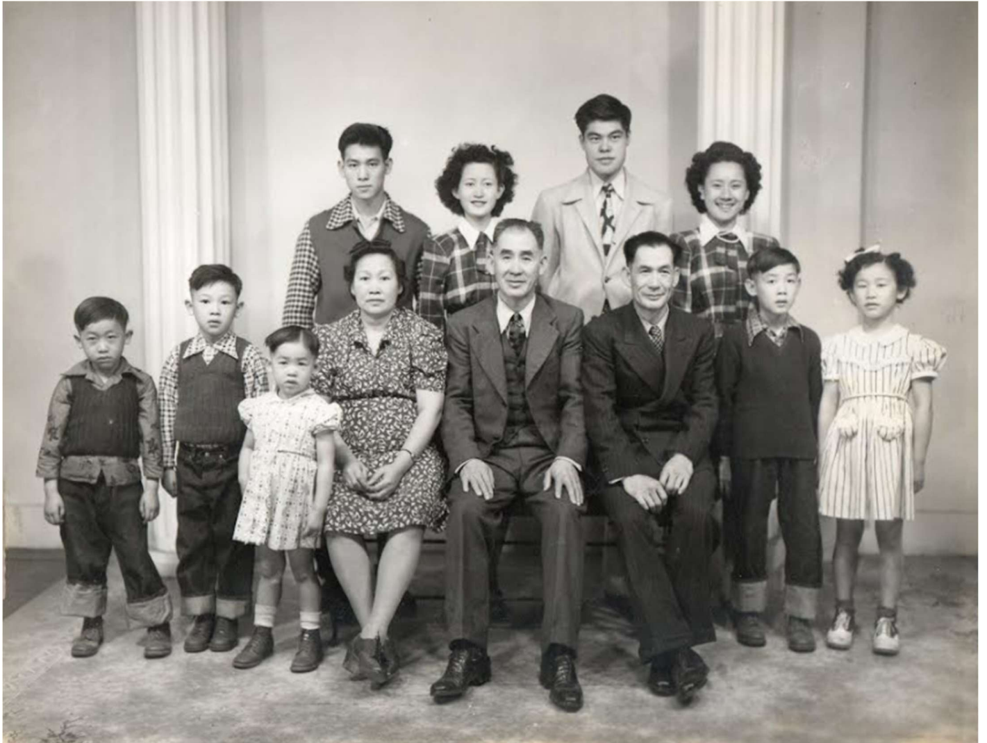
One of your many visits to our labor camp/farm in Lodi